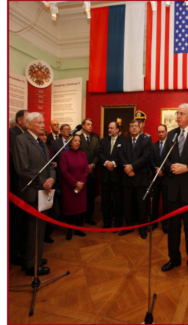
Welcoming remarks by US Ambassador