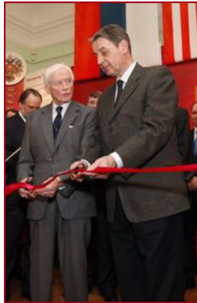
Ribbon Cutting - Hon. James W. Symington and Russian Minister of Culture, Alexander Avdeyev.

The exhibition presents over 200 unique and precious items, including the original pens used by Lincoln and Alexander II to sign the Emancipation Proclamation and the